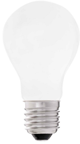
Bulb A60 MAT LED E27 8W 2700K 640Lm